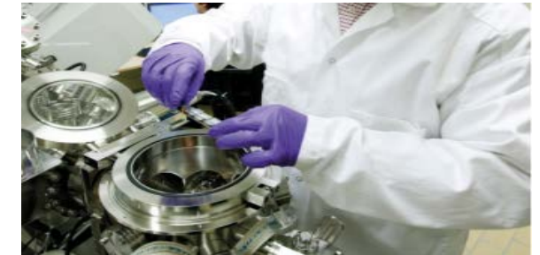
Surface Analysis in Packaging Applications