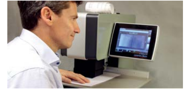
Predicting and measuring print quality