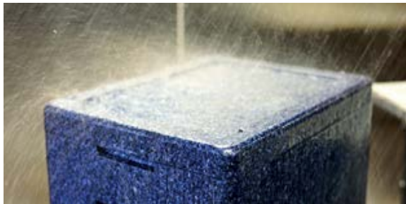
Systematic packaging development