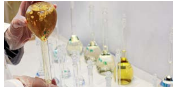
Accredited and certified operations