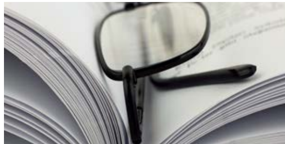
Regulation and legislation requirements