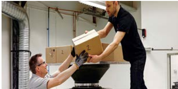
Test and validation